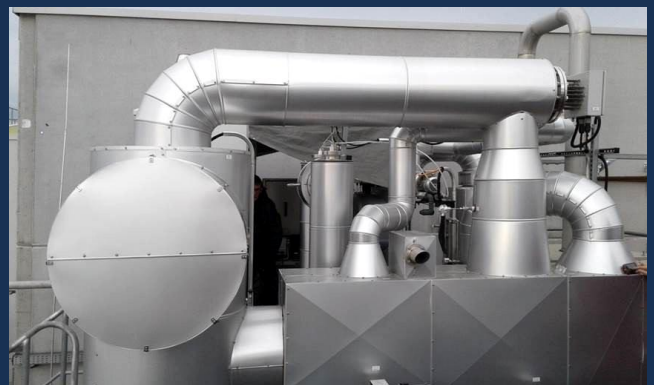
HighOx System realised