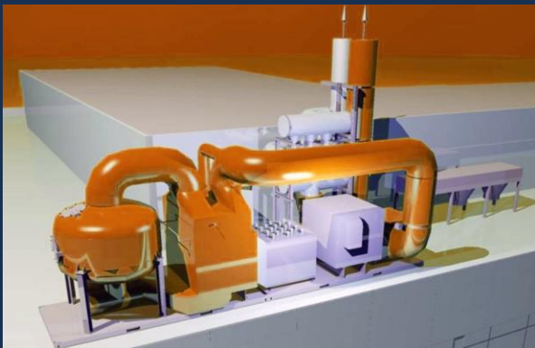
HighOx System in planing